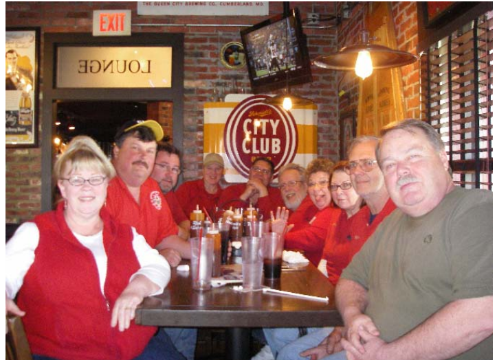
The waitress certainly earned her tips with this crowd...