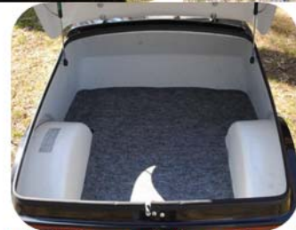
2003 Kompact Kamp Excell Motorcycle Cargo Trailer

Ordered and picked up direct from the manufacturer in PA in 2003. It has never titled or registered/considered new, not used. This trailer has only been used on several short trips. "Being sold because of non use", the trailer is in excellent condition and has been stored indoors and covered.