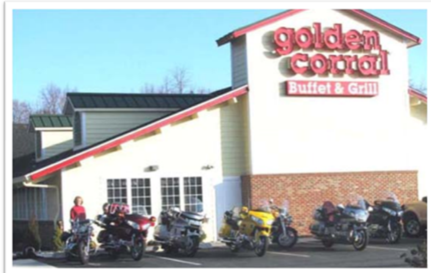
Map to "Golden Corral" Aberdeen MD.

GOLDEN CORRAL Rout 40 Across from WalMart Aberdeen, MD