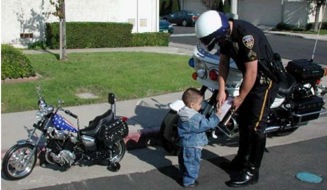
Here he is getting his very first ticket.